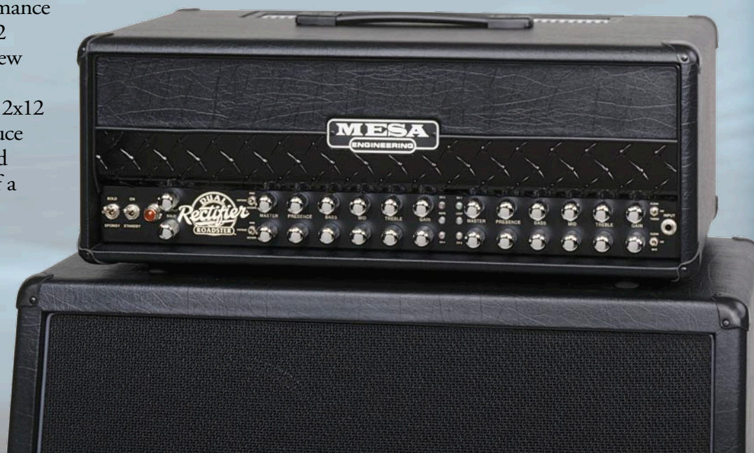
Where vintage meets hard core... Roadster Head on Rectifier 4x12