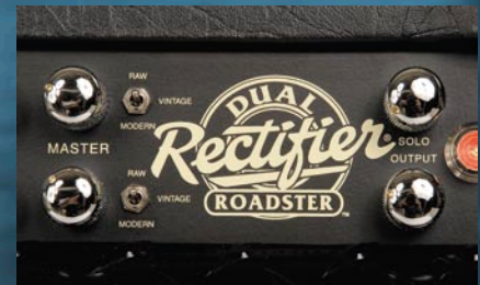
Channels 3 & 4 contain all the high-gain glory of the iconic Dual Rectifier Solo Head. These time-tested, hit-making sounds appear in the entire Rectifier family of amplifiers and in the Roadster, they're duplicated in Channels 3 and 4. RAW covers the ground between where TWEED and BRIT top out and VINTAGE begins with smooth, purring warmth. VINTAGE takes it up a notch and sings with smoldering, liquid gain for single note solo work and then there's MODERN. This is the original crushing, tight high-gain Recto® sound that changed guitar amplification forever. Accept no imitations!