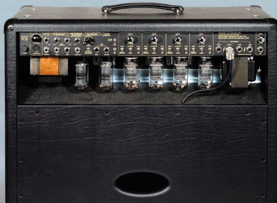
Roadster 1x12 Combo featuring ported closed-back design. Also available as 2x12 fully closed-back design.