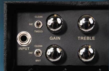
Channels 1 & 2 each offer 3 Mode choices - two of which are repeated for added flexibility when configuring your footswitching map. CLEAN and FAT modes appear in both Channels so you can set-up two very different Cleans or, clone your favorite sound and alter it slightly for clean or pushed soloing. From there, Channel 1 is home to the soulful mid gain voice of American Blues in TWEED, while Channel 2 crosses the Atlantic to crusade for classic English Rock sounds in the urgent mid gain BRIT mode.