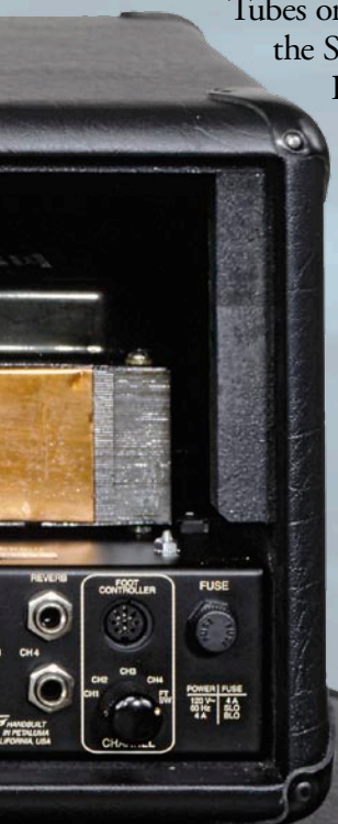
Rear panel of Roadster Head. Multi-Watt Channel- Assignable Power with Switchable Rectifiers.

So when you're looking for an exciting new ride that's easy to drive, has power to burn and can handle all the turns... check out our brand new Roadster ™ . It's the perfect addition to any guitar garage.