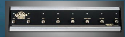
Roadster Footswitch allows instant access to channels, reverb, tuner mute, loop and solo.