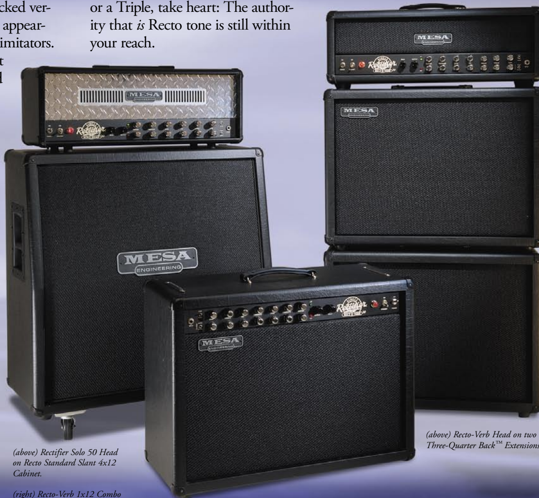
Recto-Verb available as head or beefy 1x12 combo, with separate Reverb controls per channel.

or a Triple, take heart: The authority that is Recto tone is still within your reach.